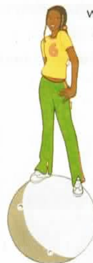
weight 110 N mass 66 kg